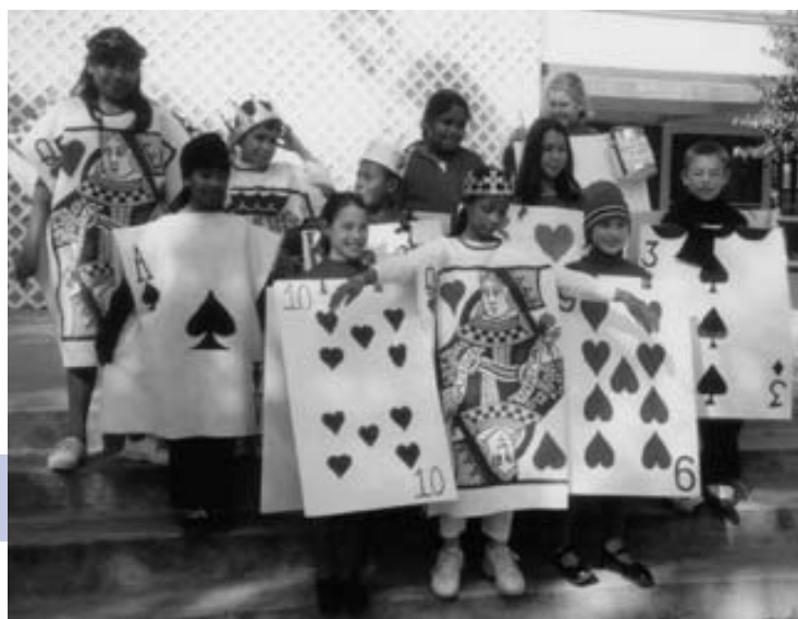
The Alice characters shown on these two pages are cleverly disguised Bullard TALENT School students.