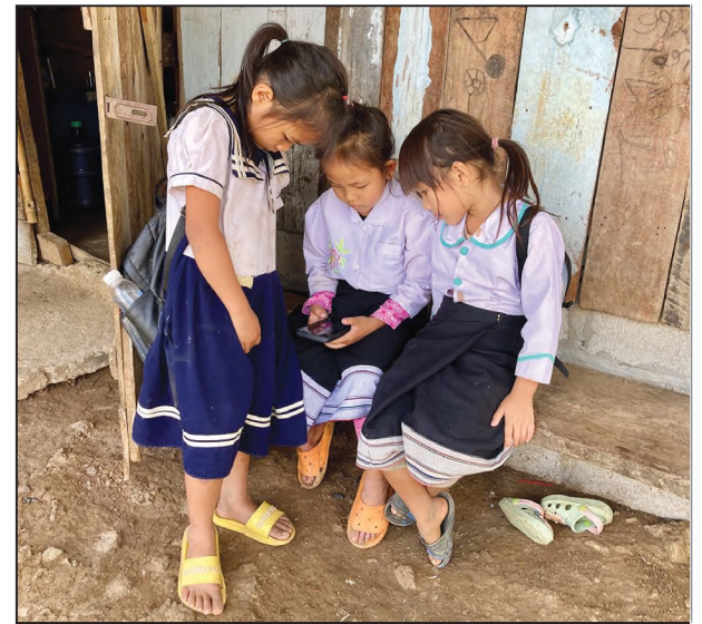
“Watching The Little Mermaid” - children in Cambodia watching the movie on an iPhone during a school lunch break.