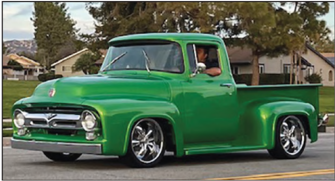
Photo spread on 2 pages showing some of the parade entries, including some beautiful classic cars.