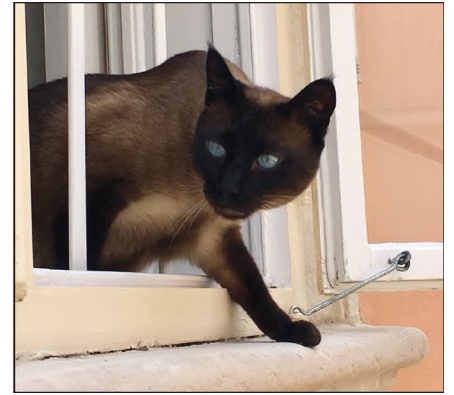
“Mr. Blue Eyes” - a photo that took first place in its category and was the first winning photo he had submitted to the LV Photo Club in 2020.