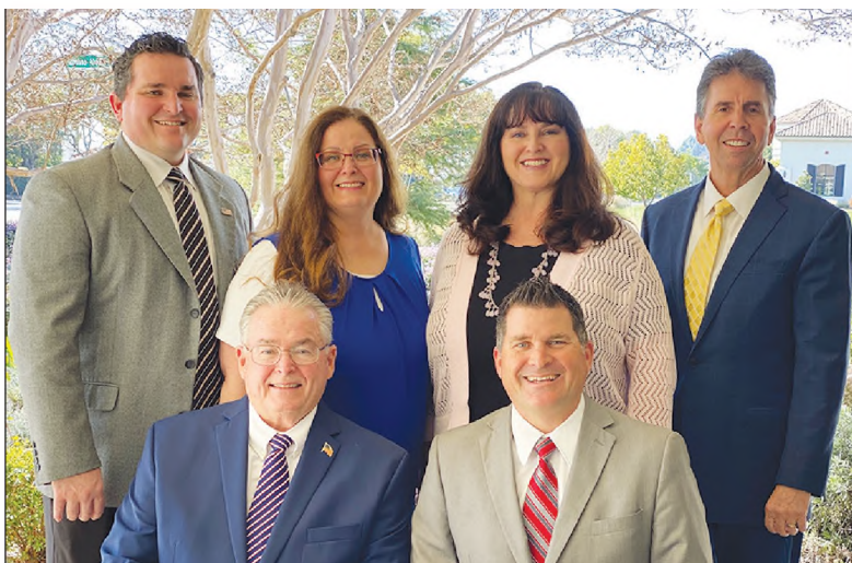
The Barlow Group DRE #01945712

...For an update on the value of your property. We Know the Village!