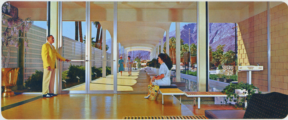
You approach the magnificent spa through this beautiful entrance.