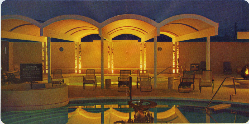
There is therapeutic magic in these natural hot mineral waters.