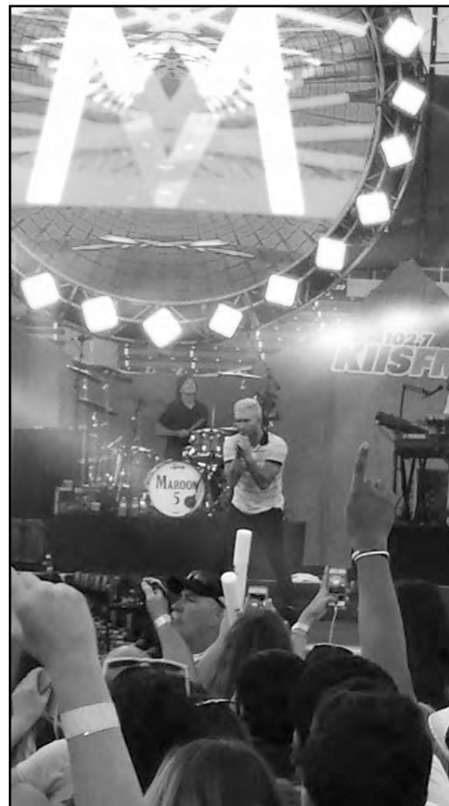
Maroon 5's Adam Levine, rocking his new bleached hair, sang some of the band's greatest hits like "This Love" and "Payphone."

Once you exit the Stubhub Center and make the long trek back to your car, your senses will get hit by the most amazing aroma of grilled hotdogs. At this moment you should reach into your wallet, pull out some cash and buy one. It will be the best hotdog you've ever eaten in your life — guaranteed. You will regret not eating one of these for the rest of your life if you miss the opportunity.