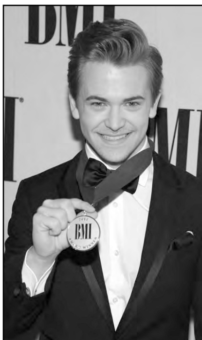
Hunter Hayes released sophomore album "Storyline" on May 6.

"And I think in going for more emotion, you have to go deeper