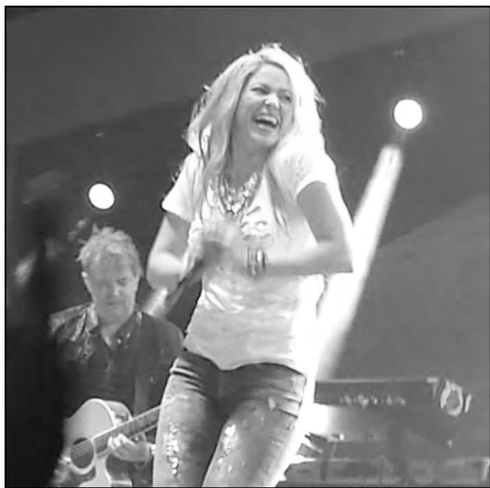
Shakira performed her hit "Hips Don't Lie" at Wango Tango Saturday, May 10.

Adding Iggy Azalea and Ariana Grande last minute was another good decision. I got to see three of my favorite female artists, and that truly made my experience exponentially greater than last year's Wango Tango. Finishing off the event with Tiesto was perfection. His set was the best I've heard, and he got everyone pumped up and