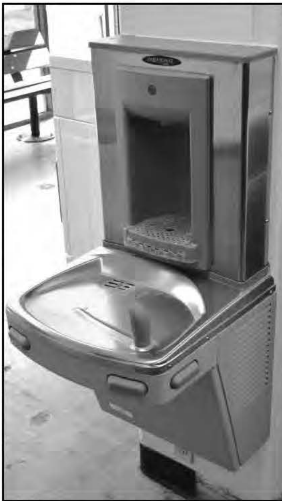
Eric Garza/The Runner ASI hopes the water stations will aid in conservation.

They are using this as a cheap ploy to hype up the pre-vote atmosphere of the school. This hydration station project is a $27,088 ego stroking for ASI. It is an excuse they will use to sit around the