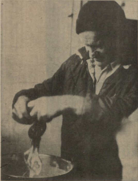
Skier cuisine a la lodge owner