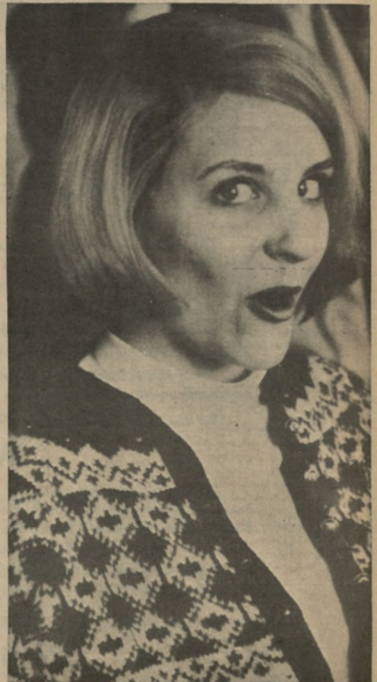
Watch the ski pole, buster