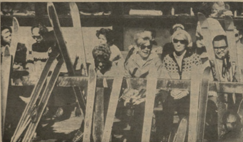
Apres skiers view action at a safe distance