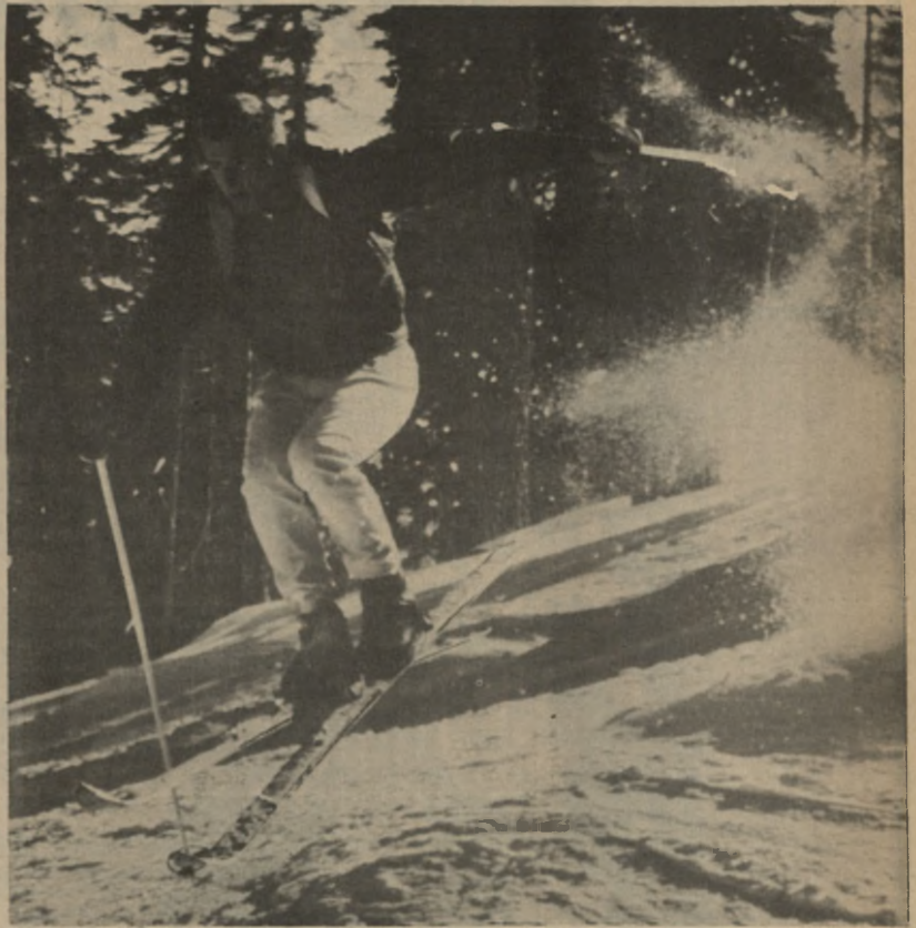
Snow flies as skier tries daring gelandesprung

The invigorating atmosphere of the mountains combined with the pleasures of skiing seemed to make this a rewarding trip for all.