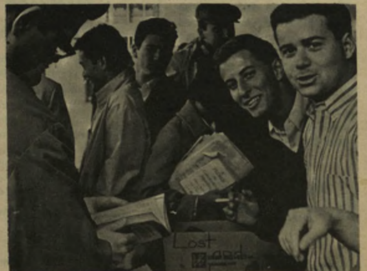
Fraternity men ignore customers to pose and smile for Gater photographer at the Delta Sigma Pi-AS Lost and Found Sale.

But, Poland continued, in today's society with an average 40 hour week "people have lots of time to spend on sensual pleasures."